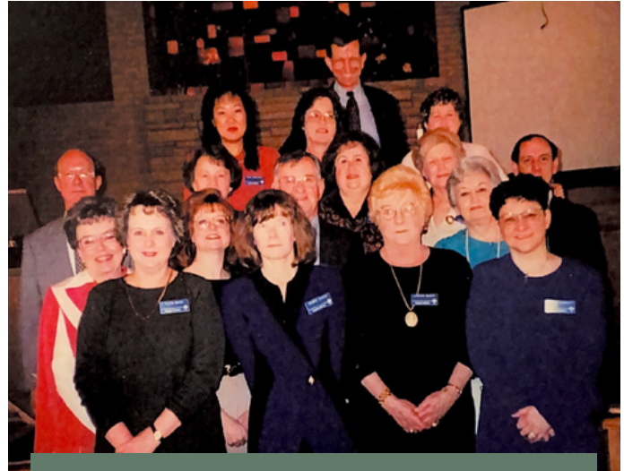
First Class of Stephen Ministers Commissioned at Pineville UMC in 1996

First and foremost, Stephen Ministry provides a caring ear and a connection to resources for anyone struggling after a crisis, like a death, health challenges, a job loss, or any kind of change.